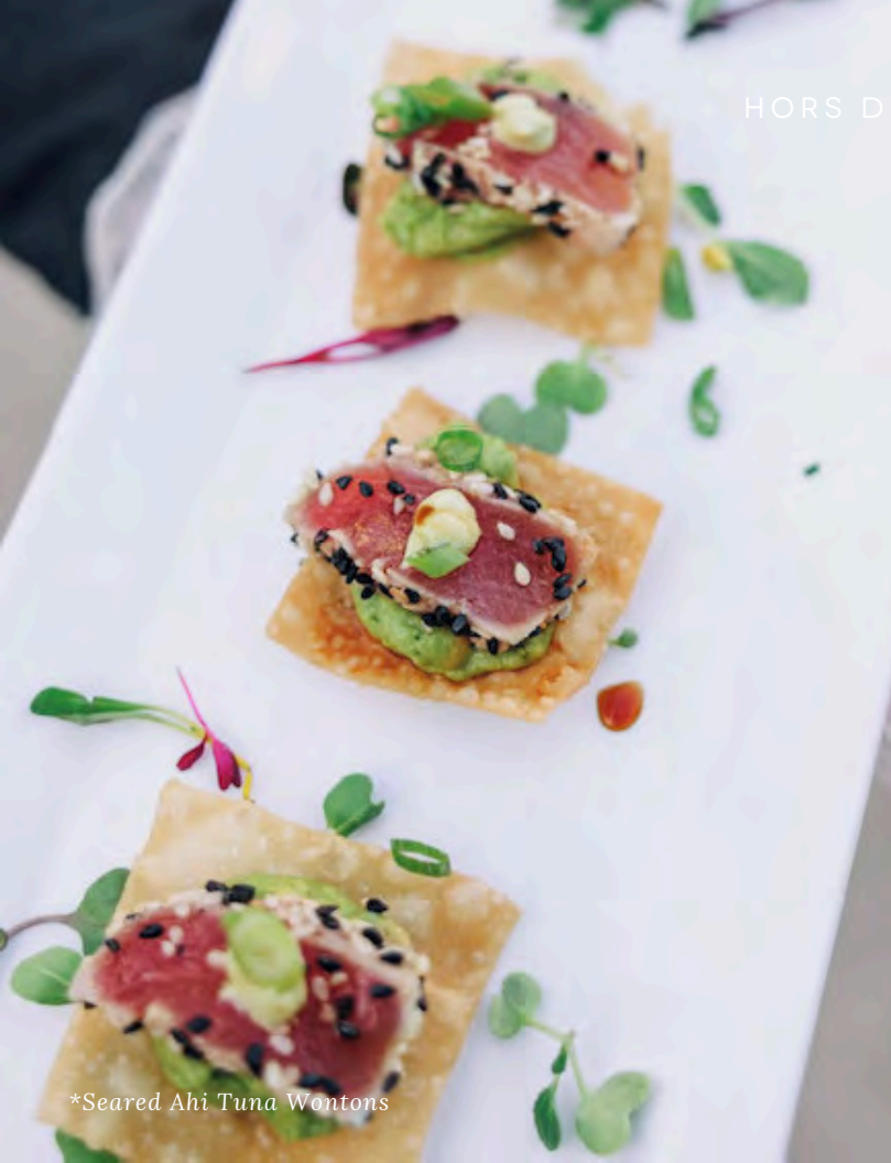
*Seared Ahi Tuna Wontons