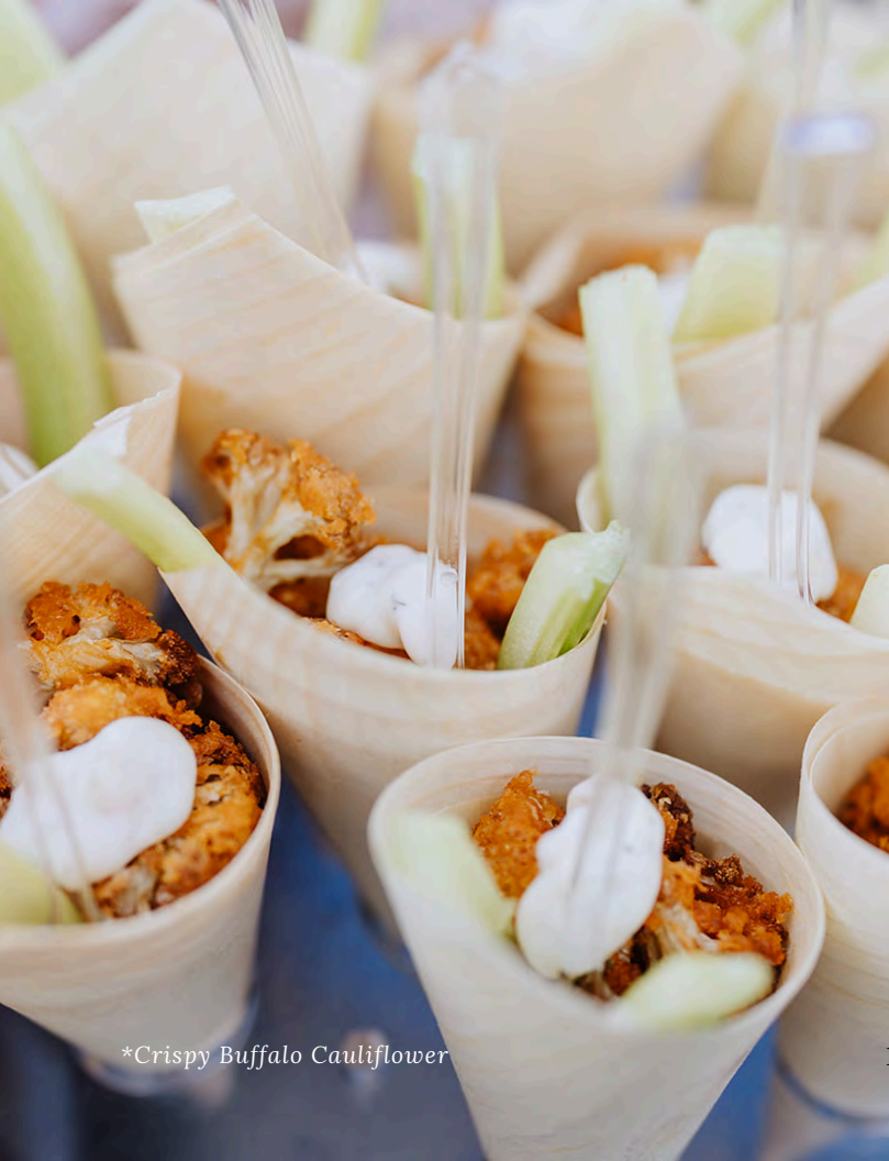
*Crispy Buffalo Cauliflower