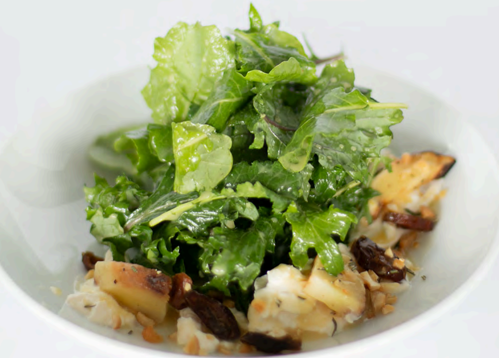
*Big Sur Date Salad