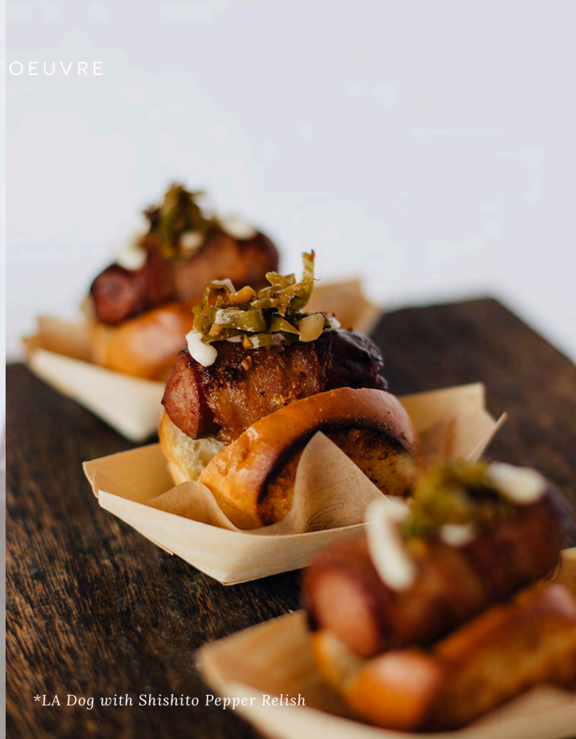
*LA Dog with Shishito Pepper Relish