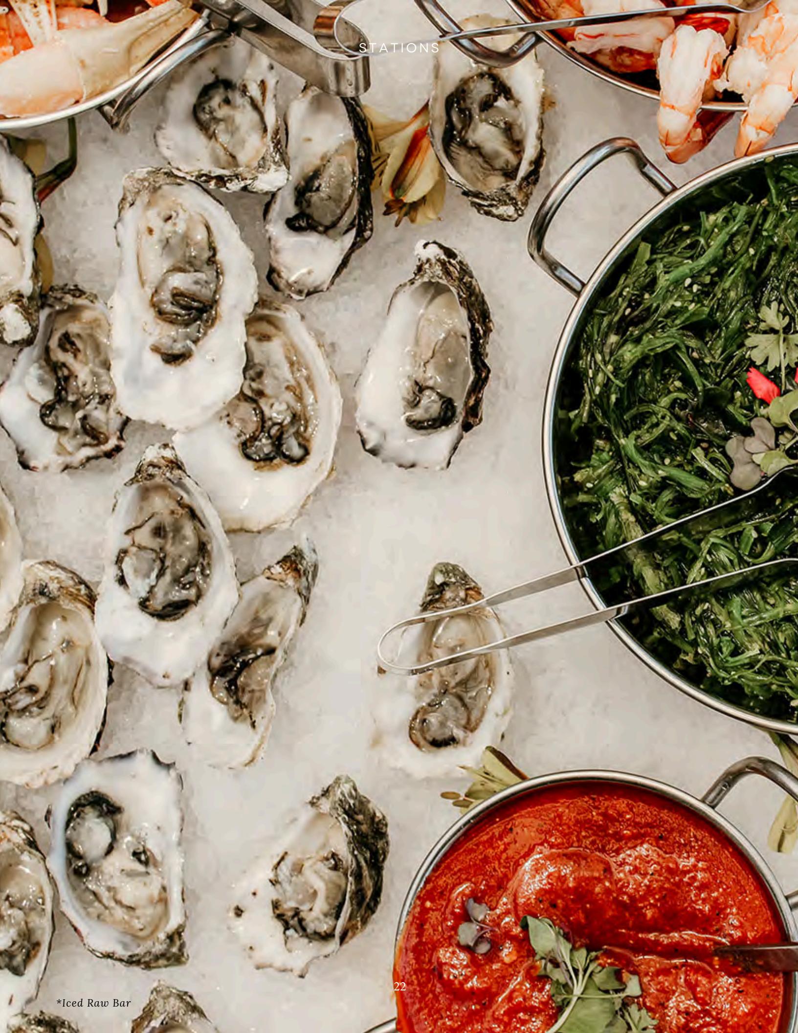
*Iced Raw Bar