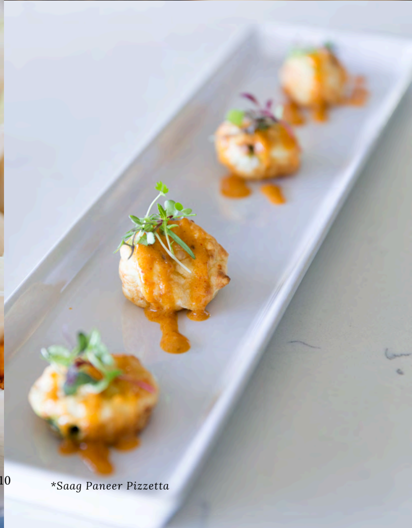
*Saag Paneer Pizzetta